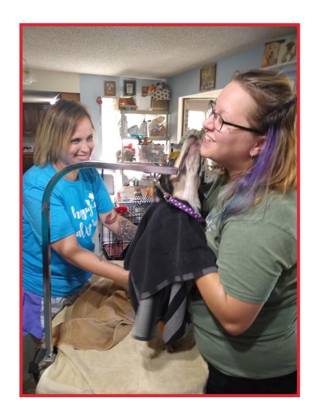
Lucky Coco loves her spa day!