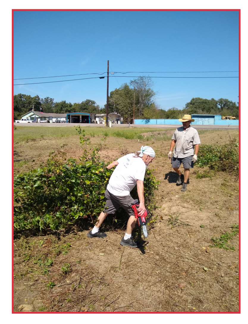
Hard work clearing brush