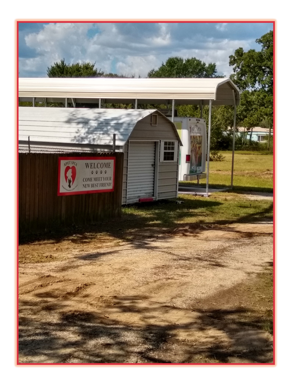
Our Newest Addition A carport cover for our adoption vehicle!

Erected in just one afternoon, we are so grateful for the many years of support and donations from members that enable us to keep adding improvements through the years. Thank you!